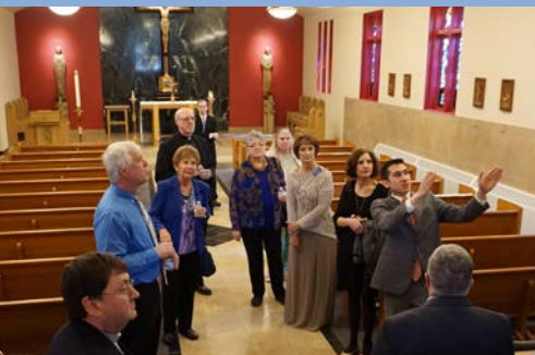
Photo taken from the Open House

We would like to invite everyone to save the date for next year's Bishops and Rectors dinner, April 12, 2019 which will be held in Rochester at the International Event Center. Archbishop Charles J. Chaput from the Archdiocese of Philadelphia will be the recipient of the Immaculate Heart of Mary Award and featured presenter.