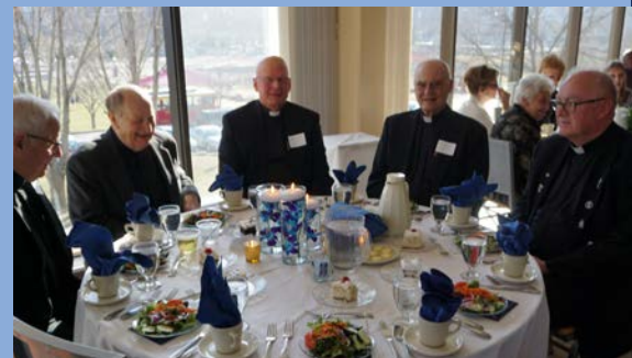
Retired priests from the Diocese of Winona-Rochester