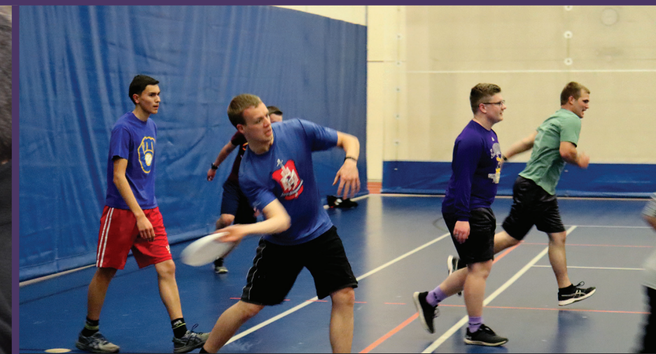
Seminarians enjoying some active time with a friendly game of indoor frisbee.